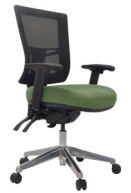
WITH ARMS SafeTex Olive