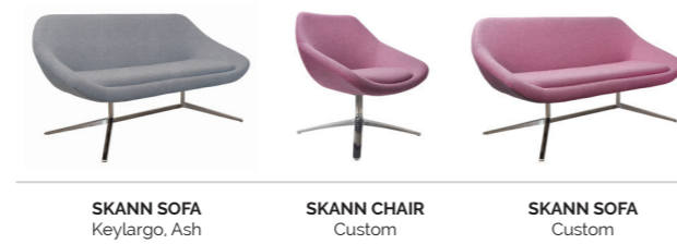
SKANN SOFA Keylargo, Ash