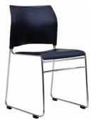
CHROME FRAME Black PP Back

520-3-3 Black with Black Powder Coat Frame