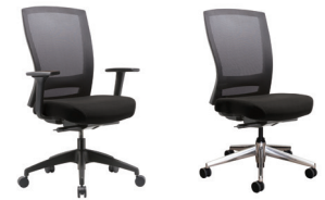
NYLON BASE Arms