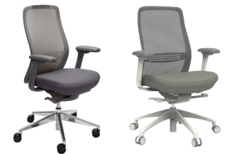
LUNA GREY Polished Aluminium base & 4D Arms