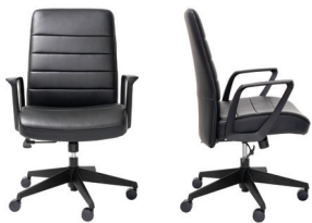
Front view Side view

Providing both executive looks & durability.