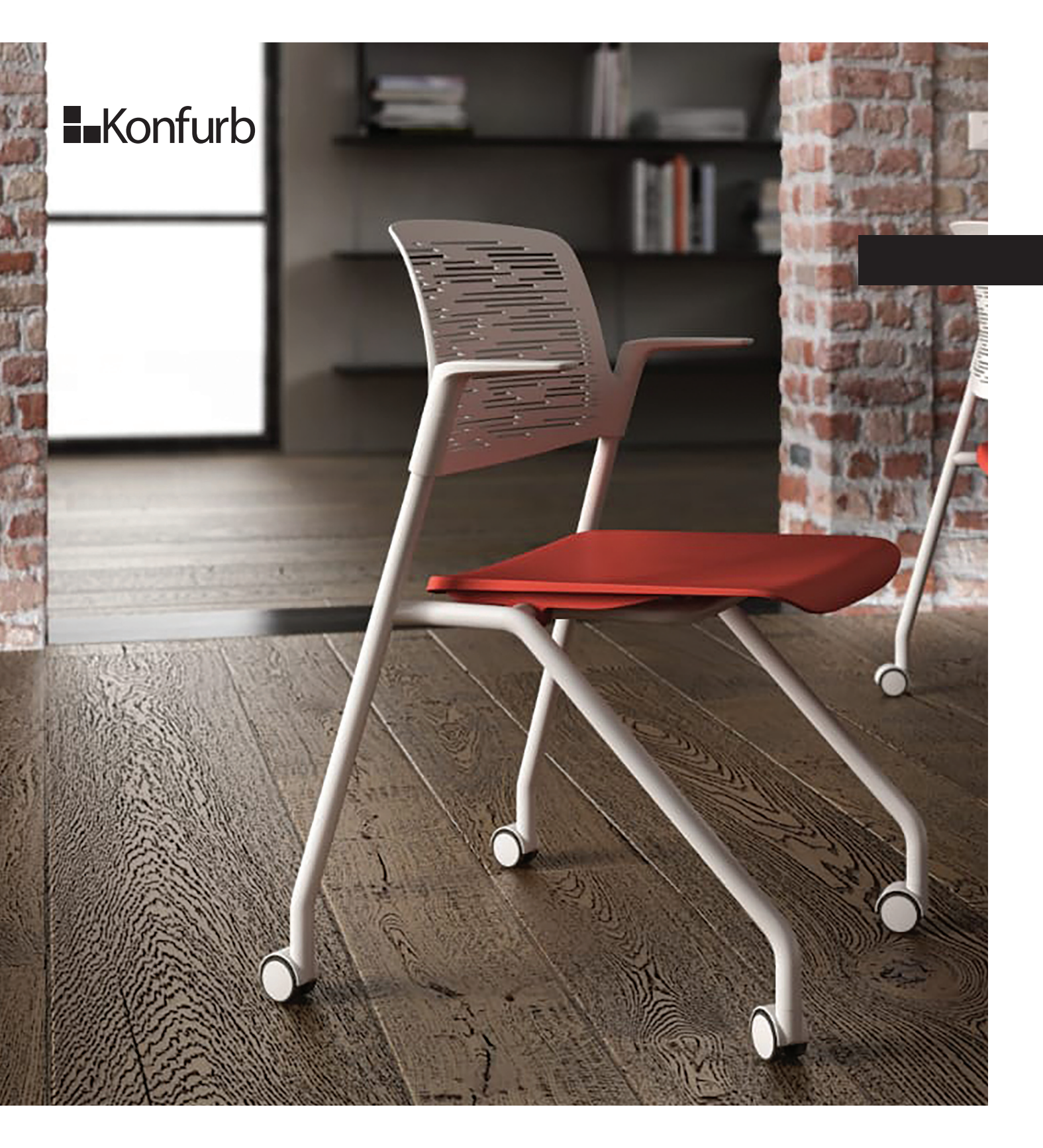
Konfurb FLX. 4 Leg Chair