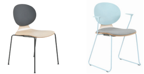
4 LEG Charcoal