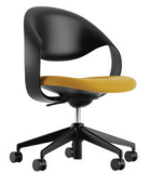
BLACK FRAME Custom seat

White Frame/Black Seat KON512-0-13 Black Frame/Black Seat KON512-3-13