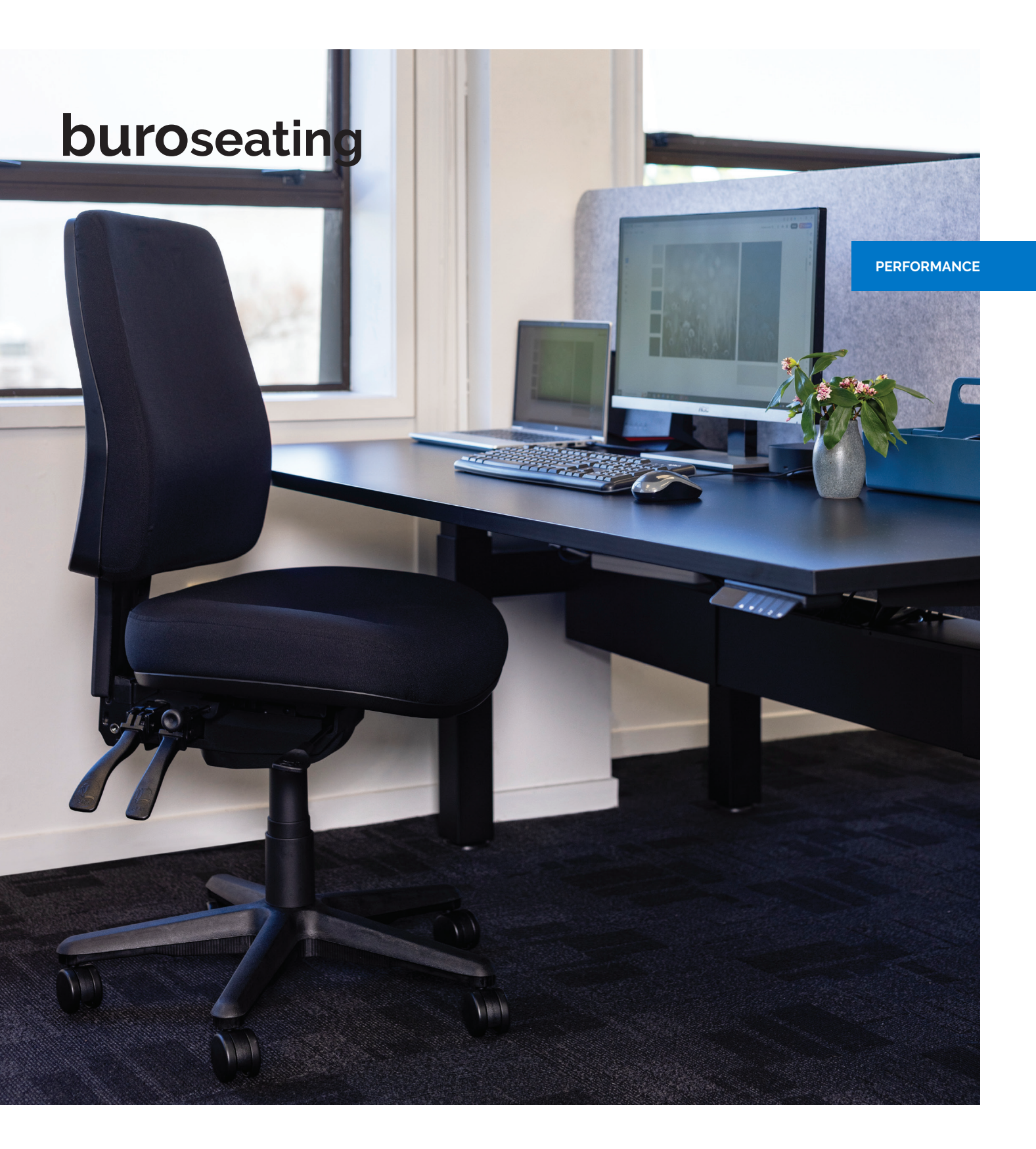
Buro Roma. 3 Lever High Back chair.